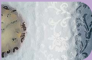
Pilkington Oriel Texture Brocade™