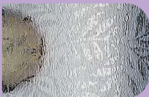
Pilkington Oriel Texture Laurel™