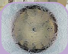
Pilkington Oriel Coppice™