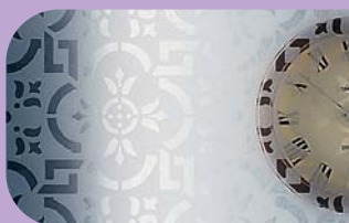
Pilkington Oriel Canterbury™