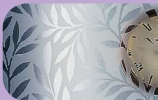
Pilkington Oriel Laurel™