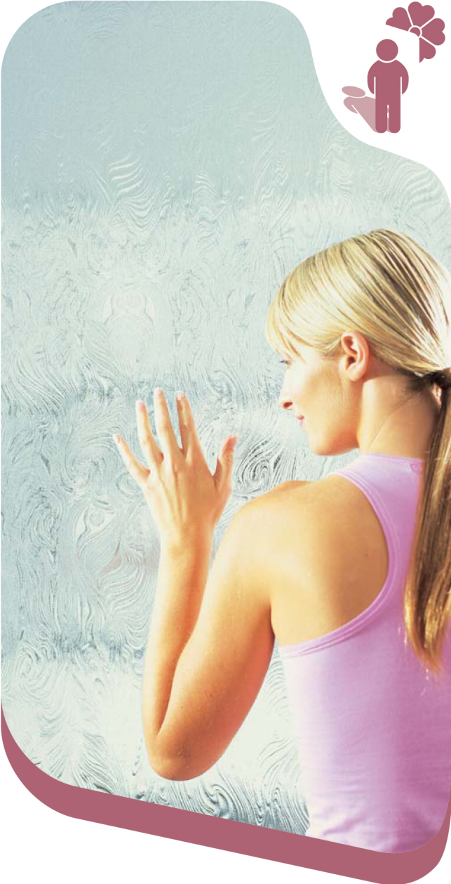
The Pilkington Texture Glass Range