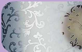
Pilkington Oriel Brocade™

With a superb range of designs, together with diffused glass options for each design, this premium range of etched glass adds a touch of style and elegance to your home.