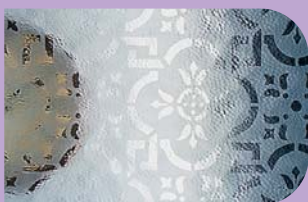
Pilkington Oriel Texture Canterbury™